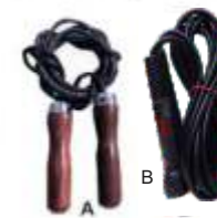
Art No. 3845 Polyester string ropes, (A) Wooden handle with bearing, (B) Wooden handle with spring.