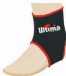
Art. No. 3826 Anklet brace made of Neoprene Available in different Size & color combination