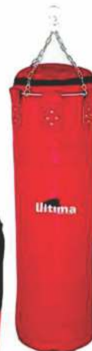
Art. No. 3725 Heavy Weight Bag Made of genuine leather with extra support for professional game. Size: 90x30cm