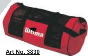
Art No. 3830 Material: PVC Parachute Available in all Sizes