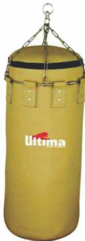
Art. No. 3723 Heavy Weight Bag made of genuine leather with extra support for professional game. Size: 120x40cm