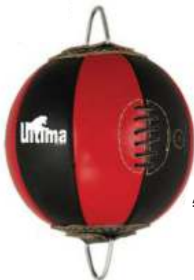
Art No. 3716