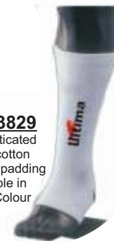
Art. No. 3829 Made of Elasticated Polyester / cotton with or without padding Also available in all Sizes & Colour