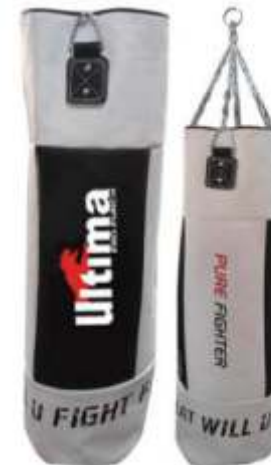
Art No. 3720 Punch heavy bag covered with durable synthetic Leather gives the sensation of hitting a real opponent. Ideal for martial arts training, fitness and boxing. A bag great for low and high kicking and punching.