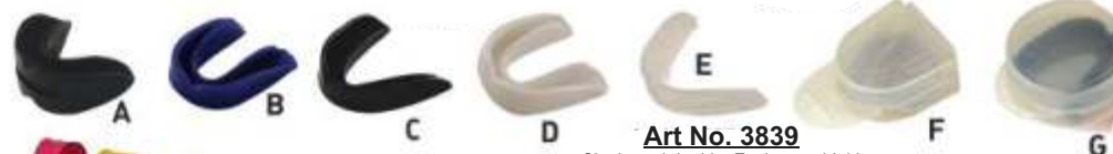
Art No. 3839 Single and double, Each gumshield is packed in a unique plastic case, includes a fitting instruction.