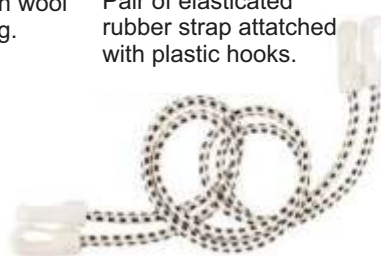
Art No. 3719 Pair of elasticated rubber strap attached with plastic hooks.