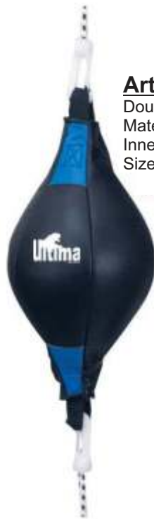
Art No. 3713 Double end striking Bag Material : Genuine Leather Inner : Latex Bladder. Sizes : Standard