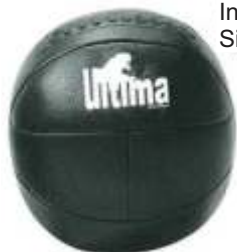
Art No. 3718 Medicine Balls Material : Genuine Leather Inner : Filled with cork + cotton wool Sizes : 1kg, 2kg, 3kg, 5kg, 7kg.