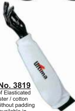
Art. No. 3819 Made of Elasticated Polyester / cotton with or without padding Also available in all Sizes & Colour