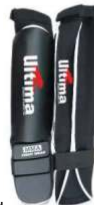
Art No. 3671 ULTIMA Shin Pad

Shin instep is padded with shaped heavy foam and is canvas lined with a genuine leather exterior. The front is gel-padded and stitch emboss for double coverage, plus it features polyurethane hook/loop closure