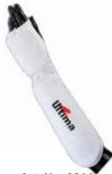
Art. No. 3814 Made of Elasticated Polyester / cotton with or without padding Also available in all Sizes & Colour