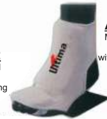
Art. No. 3823 Made of Elasticated Polyester / cotton with or without padding Also available in all Sizes & Colour