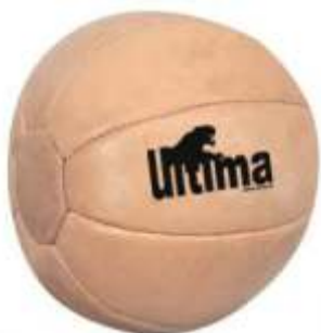
Art No. 3717 Medicine Balls Material : Cordley kid Inner : Filled with cork+cottonwool Sizes : 1kg, 2kg, 3kg, 5kg, 7kg.