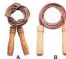
Art No. 3844 Genuine leather ropes, Wooden handle without bearing.