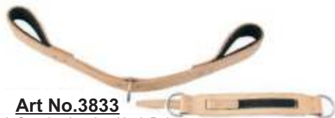
Art No. 3833 Material: Genuine Leather Neck Belt