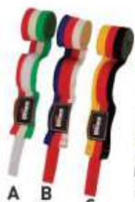
Art No. 3840