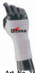
Art. No. 3815 Made of Elasticated Polyester / cotton with or without padding Also available in all Sizes & Colour