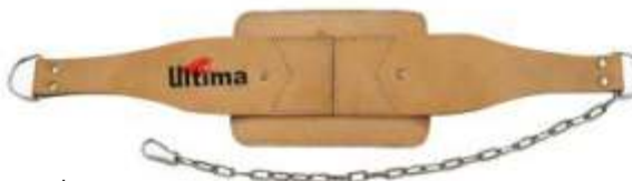
Art. No. 3805 Material: genuine Leather Dip Belt