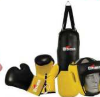
Art No. 3837 Boxing Set in Artificial Leather Contain Punching Bag & Boxing Gloves. All colours available Sizes: 10 Oz