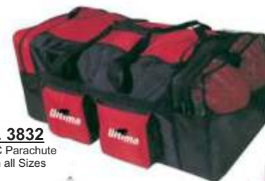
Art No. 3832 Material: PVC Parachute Available in all Sizes