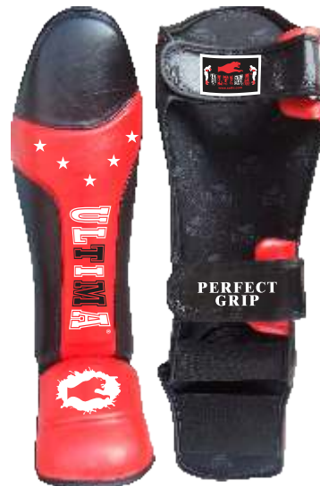
Art. 2018-3668 Shin Instep Pads made of High Quality cow high leather quality Specifically designed with an extra thick membrane Multi layer dual cross Velcro strap closure system Padded