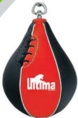
Art No. 3712 Speed Bags With Metal Hook Material : Cordley Kid Inner : Latex Bladder. Sizes : S, M, L