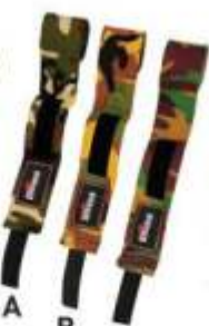
Art No. 3841