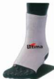
Art. No. 3827 Made of Elasticated Polyester / cotton with or without padding Also available in all Sizes & Colour