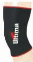
Art. No. 3825 Anklet brace made of Neoprene Available in different Size & color combination