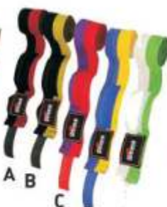
Art No. 3842 E