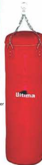
Art. No. 3726 Heavy Weight Bag Thai style Made of genuine leather with extra support for professional game. Size: 100x30cm