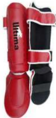
Art No. 3670 ULTIMA Shin Pad

Shin instep is padded with shaped heavy foam and is canvas lined with a genuine leather exterior. The front is gel-padded and stitch emboss for double coverage, plus it features polyurethane hook/loop closure