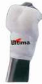
Art. No. 3816 Made of Elasticated Polyester / cotton with or without padding Also available in all Sizes & Colour