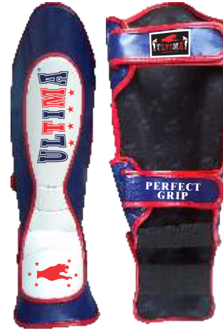
Art. 2018-3667 Shin Instep Pads made of High Quality Two Tone PU quality Specifically designed with an extra thick membrane Multi layer dual cross Velcro strap closure system Padded