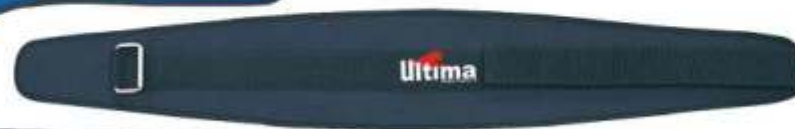
Art. No. 3813 Material: Neoprene