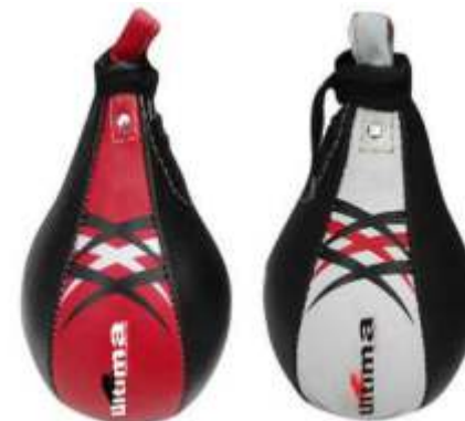
Art No. 3715 Speed Ball Classical Color Combination Made of Leather. Has an inflatable bladder inside which is pumped using normal football pump. Tie design allow to be replaced Available in Assorted Color & Sizes