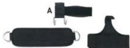
Art No. 3834 Material: Synthetic Leather Wrist & ankle Lifter