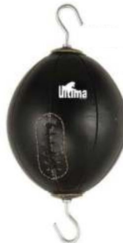
Art No. 3714