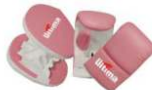
Art No. 3836 Girls Training set.