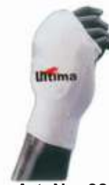
Art. No. 3817 Made of Elasticated Polyester / cotton with or without padding Also available in all Sizes & Colour