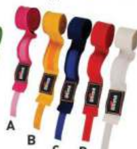
Art No. 3843