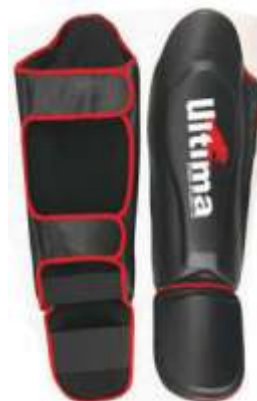
Art No. 3673

Shin In Step Made of High Quality Japanese PU Specifically designed with an extra thick membrane unique Enhanced Gel Tech padding Multi layer dual cross Velcro strap closure system Padded with injected mould foam for moisture-management Hand Made foot pad with extra grip at the back