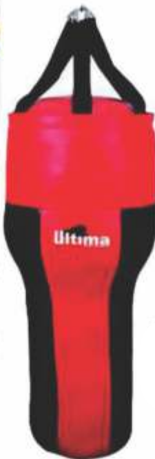
Art. No.3722 Made of vinyle reinforced with laminated layers Size: 140x35cm