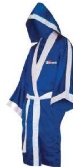
Art. No. 3783 Robes with or without Hood Material: Heavy Luxurious satin Size: S, M, L, XL.