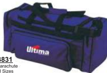
Art No. 3831 Material: PVC Parachute Available in all Sizes