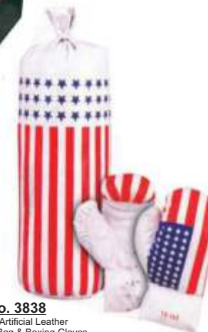
Art No. 3838 Boxing Set in Artificial Leather Contain Punching Bag & Boxing Gloves. All colours available Sizes: 10 Oz