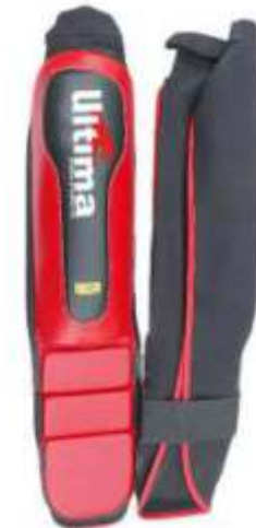
Art No. 3669 ULTIMA Shin Pad Neoprene Gel Shin Pads are padded with shock absorbing foam. This foam is designed to lessen the force of anything it comes into contact with. More specifically, it is made from injection moulded intelligent memory foam which helps to distribute the force of any impact. This means that you are better protected from injury.