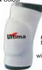
Art. No. 3821 Made of Elasticated Polyester / cotton with or without padding Also available in all Sizes & Colour