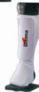
Art. No. 3828 Made of Elasticated Polyester / cotton with or without padding Also available in all Sizes & Colour