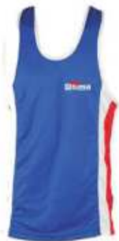
Boxing Vest made of 100% polyester Available in different Sizes & color combination