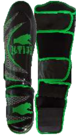
Art. 2018-3666 Shin Instep Pads made of High Quality Two Tone PU quality Specifically designed with an extra thick membrane Multi layer dual cross Velcro strap closure system Padded