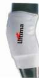
Art. No. 3818 Made of Elasticated Polyester / cotton with or without padding Also available in all Sizes & Colour