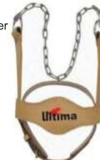
Art. No. 3806 Material: genuine Leather Head Lifter