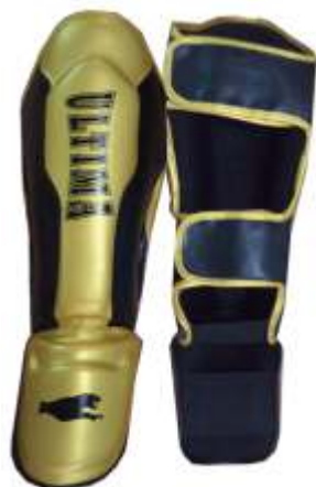
Art No. 3672 ULTIMA Shin in Step

Shin-n-step especially designed for the grappler Neoprene support secures the guard to the foot & shin even through the most intense scrambles, Leather striking areas for durability & soft EVA foam padding.