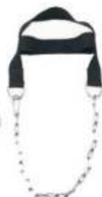
Art No. 3835 Material: Synthetic Leather Head Lifter