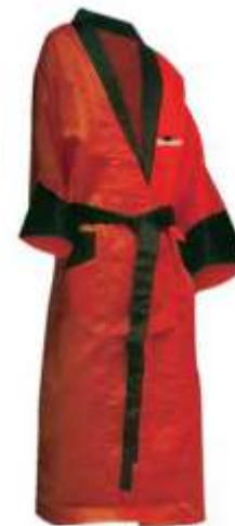
Art. No. 3782 Robes with or without Hood Material: Heavy Luxurious satin Size: S, M, L, XL.