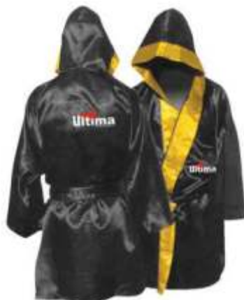
Art. No. 3781 Robes with or without Hood Material: Heavy Luxurious satin Size: S, M, L, XL.