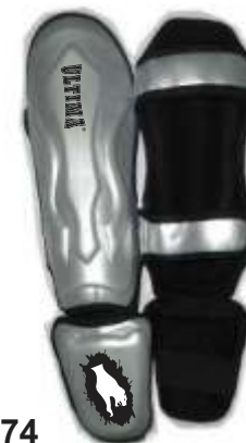
Art No. 3674

Shin Instep Pads made of PU quality Specifically designed with an extra thick membrane unique Enhanced Gel Tech padding Multi layer dual cross Velcro strap closure system Padded with injected mould foam for moisture-management Hand Made foot pad with extra grip at the back