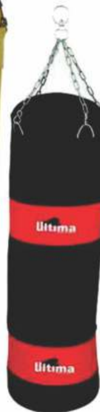
Art. No. 3724 Heavy Weight Bag Made of canvas for training purpose Size: 100x20cm