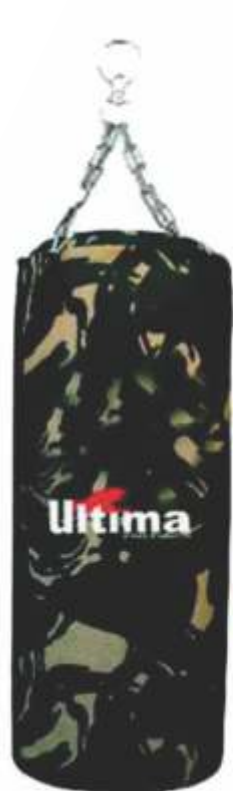
Art. No. 3721 Cameollege Heavy Bag Made of Nylon cardora Size: 140x35cm