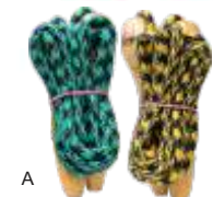
Art No. 3846 Nylon string ropes, Wooden handle with bearing